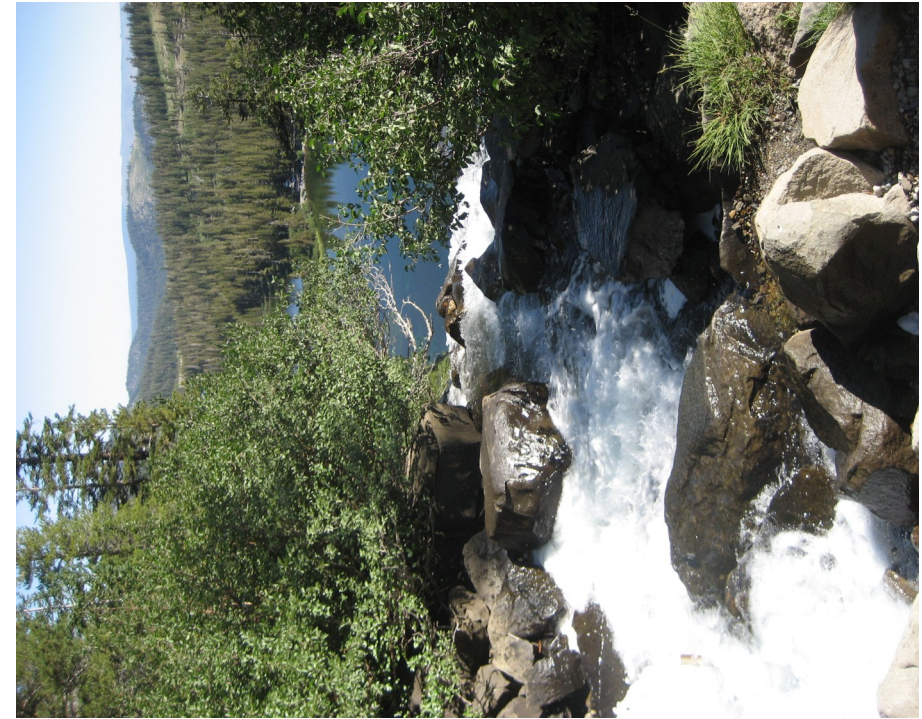
Bishop Trip September 2011

LOMA LINDA HARLEY OWNERS GROUP 300 SPONSORED BY QAID HARLEY DAVIDSON LOMA LINDA VOLUME 1 ISSUE 10 OCTOBER 2011