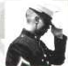
WARRIOR FOUNDATION FREEDOM STATION®

THIS IS OUR 10TH ANNIVERSARY!! GO TO WWW.INJUREDWARRIORRIDE.COM FOR INFO.