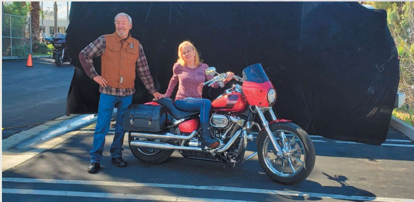
I Love my Hog Photo shoot