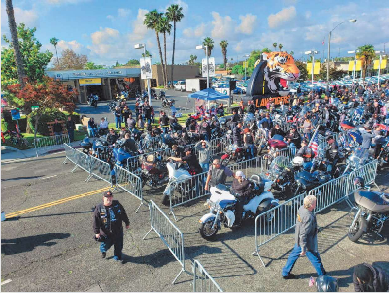
West Coast Thunder