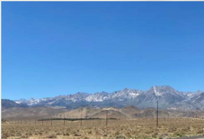
OUR VIEW FROM BISHOP