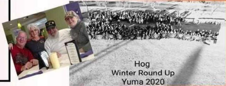
Hog Winter Round Up Yuma 2020