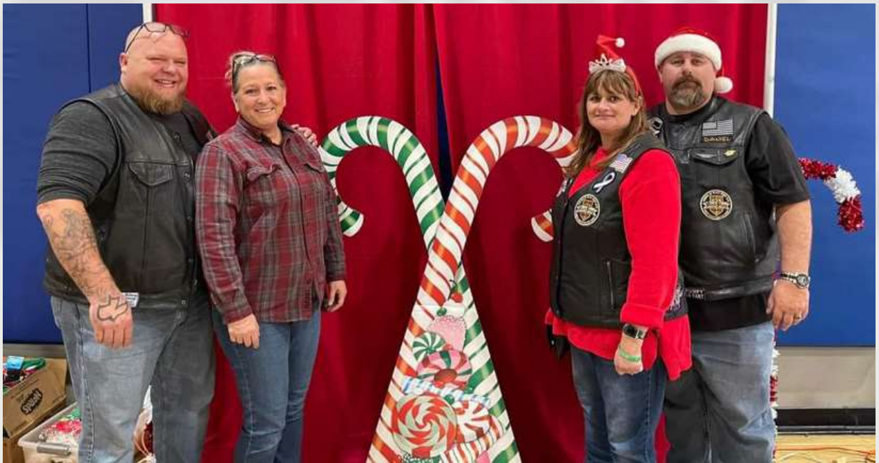
Loma Linda Harley Owners Group - Where Everyone Is Welcome