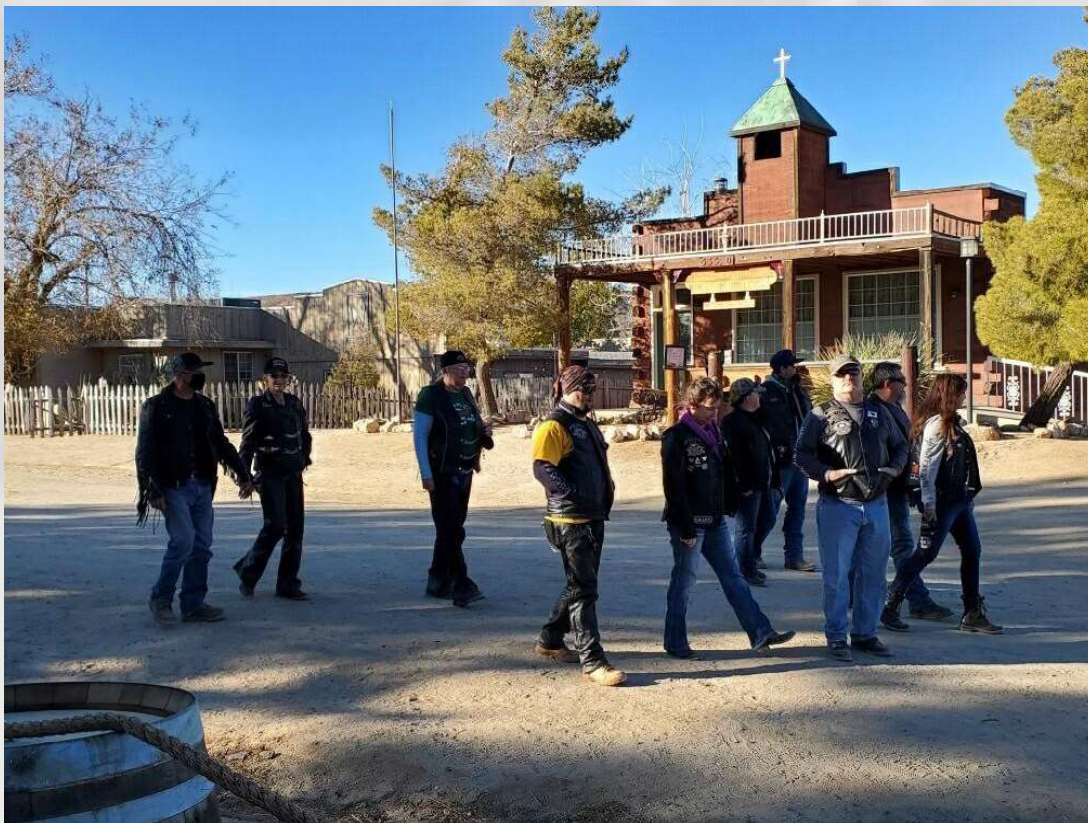
Loma Linda Harley Owners Group - Where Everyone Is Welcome