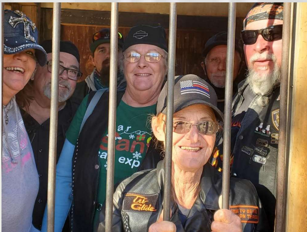
Loma Linda Harley Owners Group - Where Everyone Is Welcome