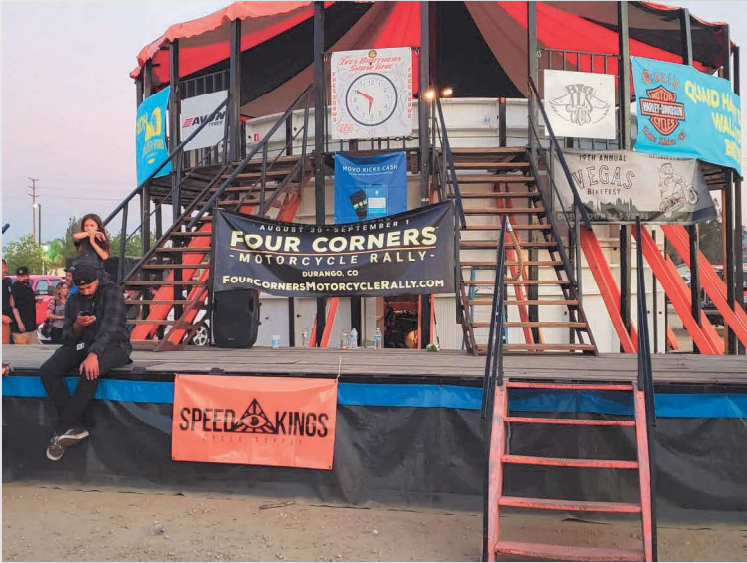
Wall of Death