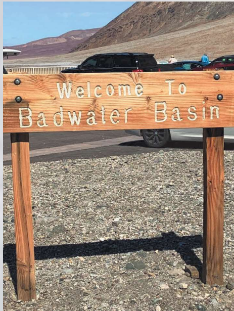
Death Valley Overnighter