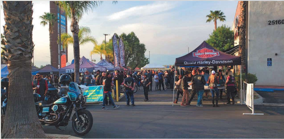
Quaid Bike Night